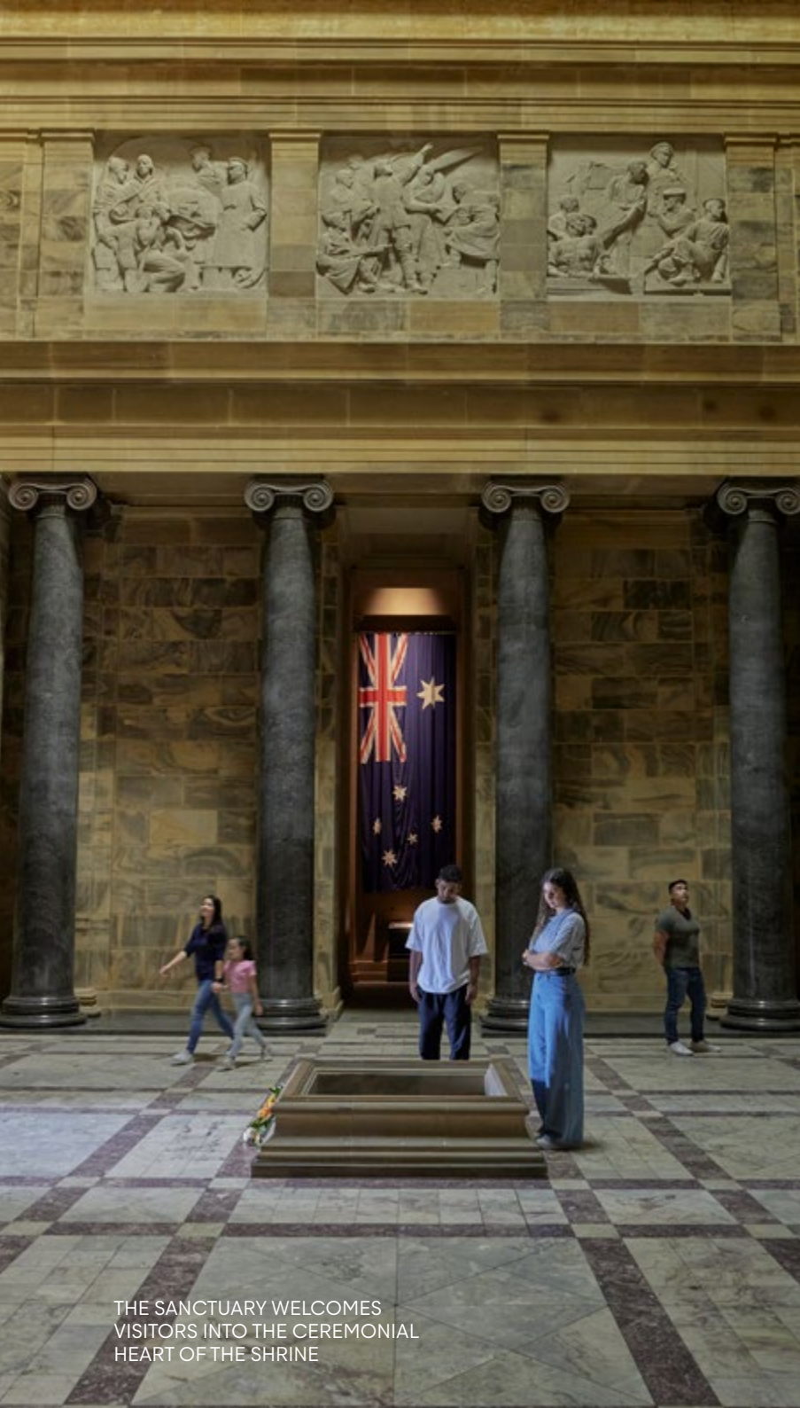
THE SANCTUARY WELCOMES VISITORS INTO THE CEREMONIAL HEART OF THE SHRINE